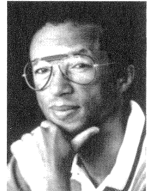
Arthur Ashe (1943—1993) NJTL Co-Founder

Arthur Ashe was an American hero fighting battles both on and off the court. In his life, he broke barriers in the tennis world, becoming a three time grand slam champion, and the first African American male to win a grand slam tournament. Off the court, he was a social activist taking on issues like racial prejudice, AIDS, apartheid, and youth education. One of his many legacies includes the National Junior Tennis League ("NJTL"), a network of youth serving organizations that provides tennis and education for all. His wish was for NJTL to be a resource for kids to develop skills for leadership and academic excellence. As a participant at one of the 520 NJTLs across the country, we want to hear what Arthur Ashe means to you.